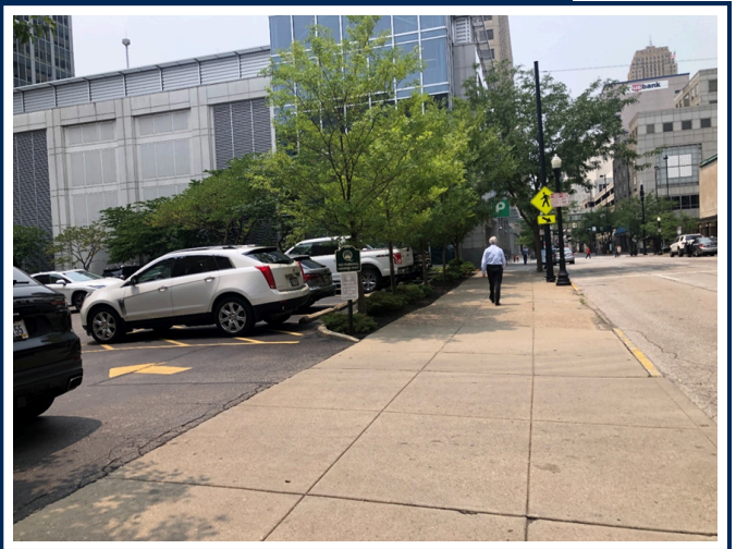
Curb Stop & Landscaping