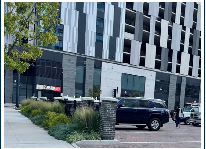
Fence & Landscaping